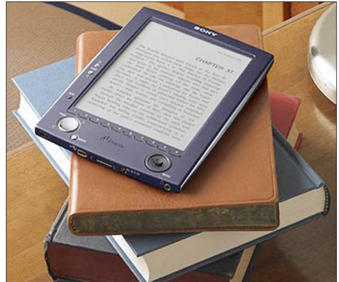
Sony E-Book Reader

Preston, D. Portable e-book reader system: what are the benefits of owning one?. Available from: http://www.ezinearticles.com/?portable-Ebook-Reader-System [Accessed 21 March 2009]